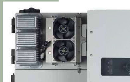
Replaceable power stage set